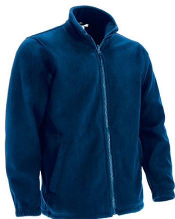
Detail inner polar fleece layer