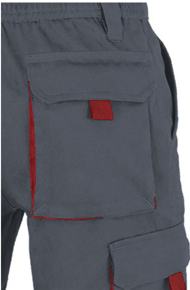
Detail inner pocket