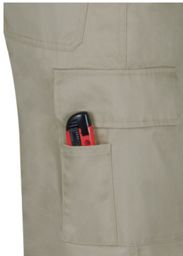
Detail lateral pocket with cutter knife pocket