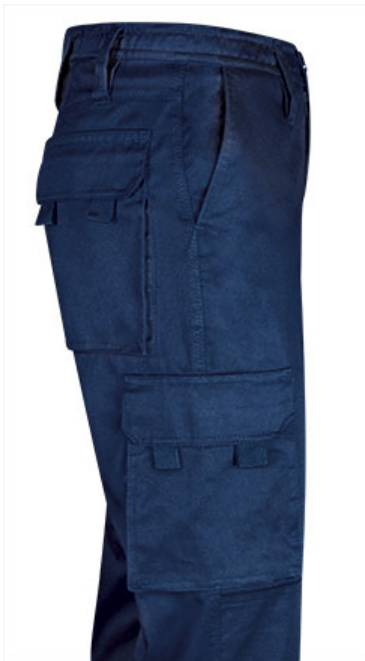
Detail inner pocket