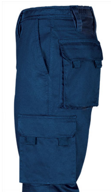
Detail inner pocket