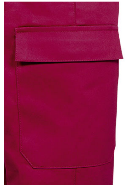
Detail inner pocket