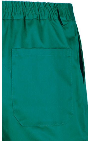
Detail back pocket