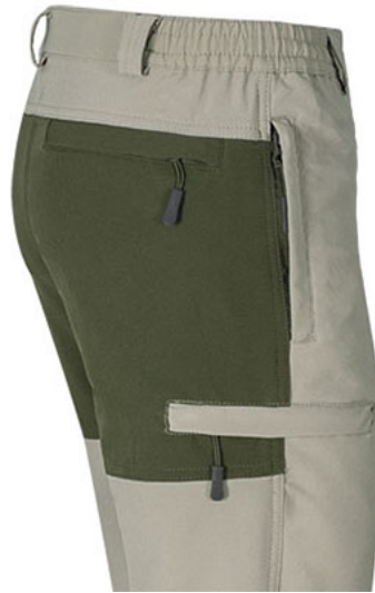
Detail one side