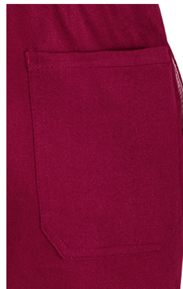
Details back right side pocket