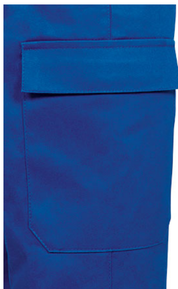
Detail inner pocket