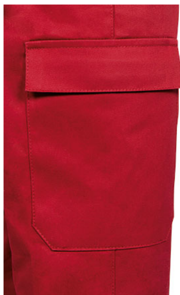
Detail inner pocket