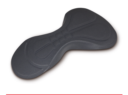
Detail: inside foam pad