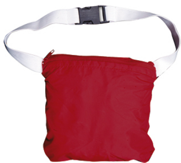
Detail: pocket bag