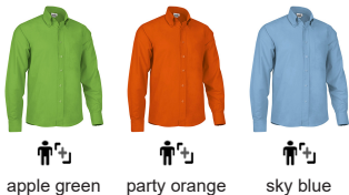
apple green party orange sky blue

Available colours for big Available colours for adult