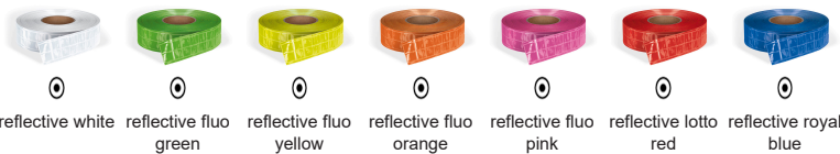
⓪ reflective white ⓪ reflective fluo green ⓪ reflective fluo yellow ⓪ reflective fluo orange ⓪ reflective fluo pink ⓪ reflective lotto red ⓪ reflective royal blue