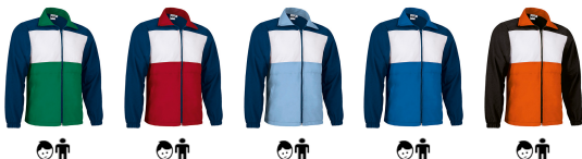
night navy blue-kelly green-white night navy blue-lotto red-white night navy blue-sky blue-white night navy blue-royal blue-white black-party orange-white

Available colours for adult Available colours for kid