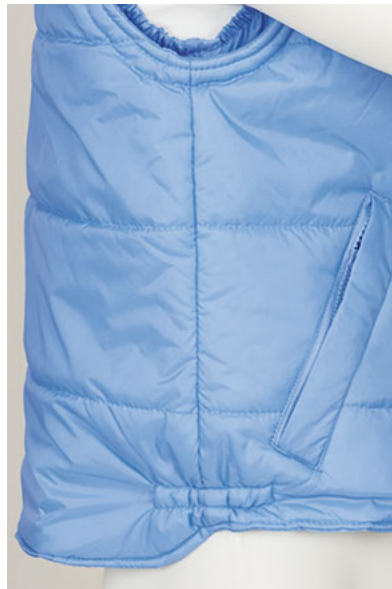
Lateral view: prolonged back part