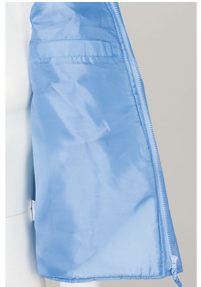
Detail inner left pocket