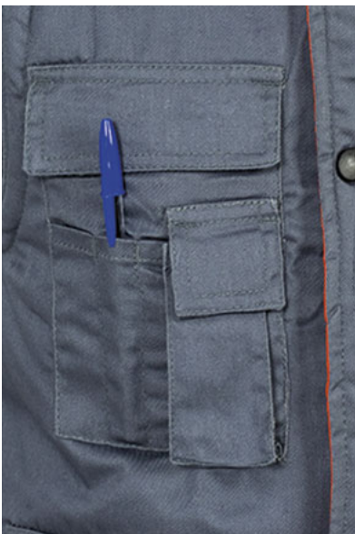
Detail right chest pocket