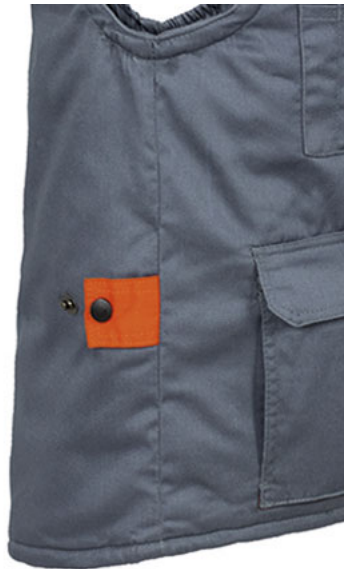
Lateral view: prolonged back part