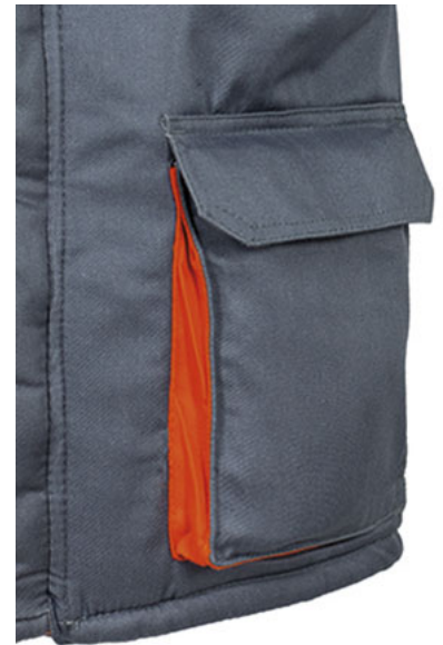
Detail pleated pocket in contrast color