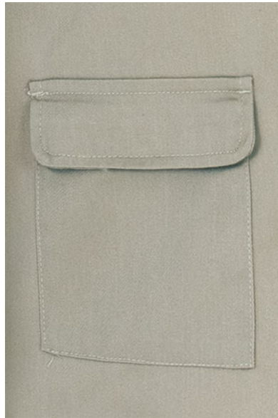
Detail back pocket