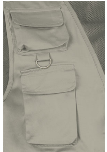
Detail front pockets and buckle