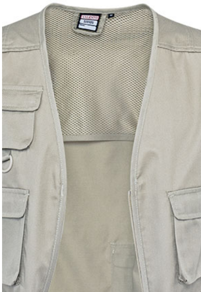
Detail inner mesh fabric