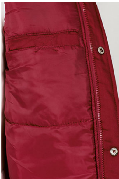
Detail inner left pocket