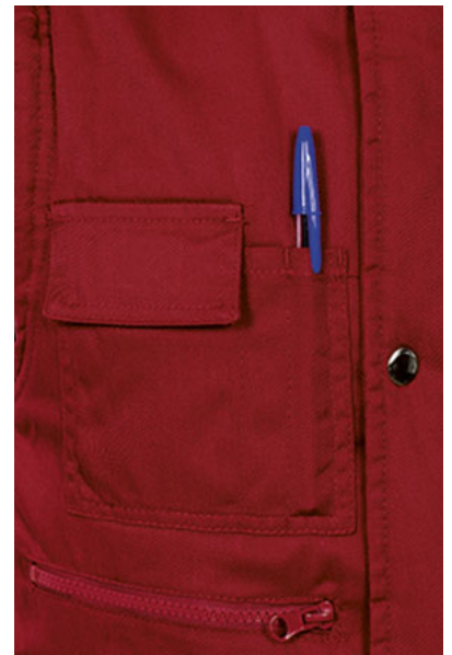
Detail right chest pocket