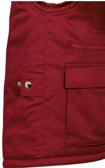
Lateral view: prolonged back part