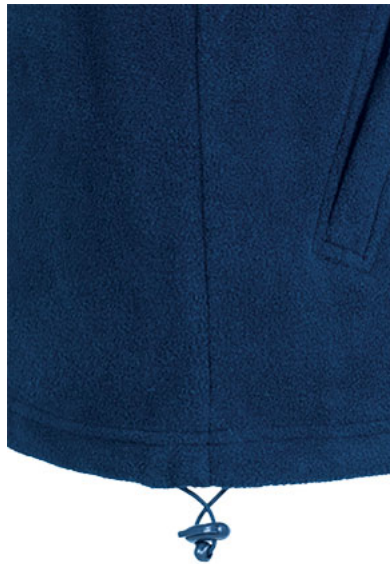
Detail drawstring waist with stoppers