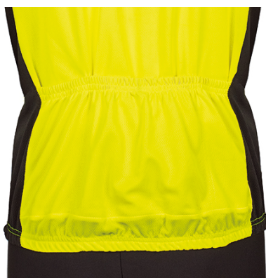
Detail: back pocket