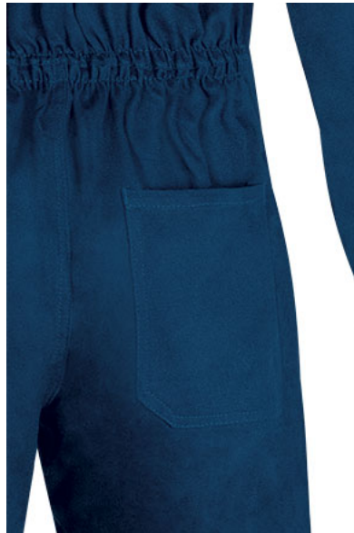
Details back right side pocket