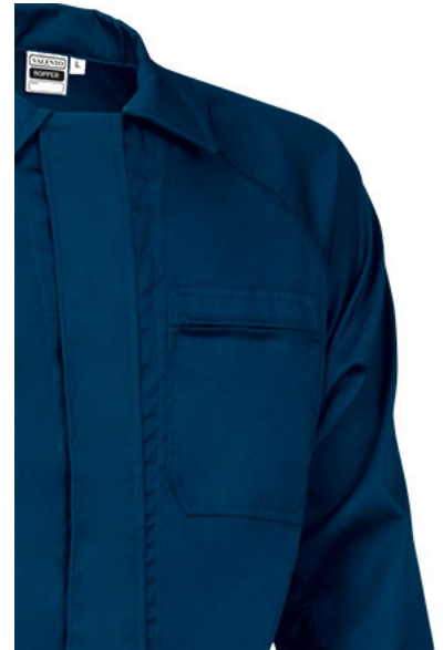
Detail left chest pocket