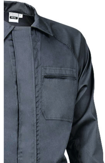
Detail left chest pocket