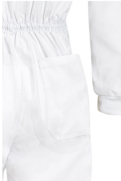
Details back right side pocket