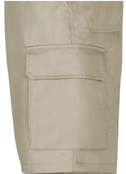
Detail inner pocket