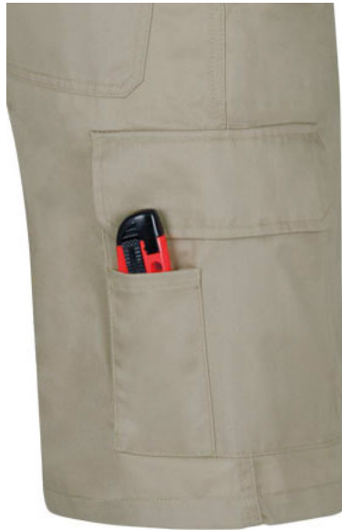
Detail lateral pocket with cutter knife pocket